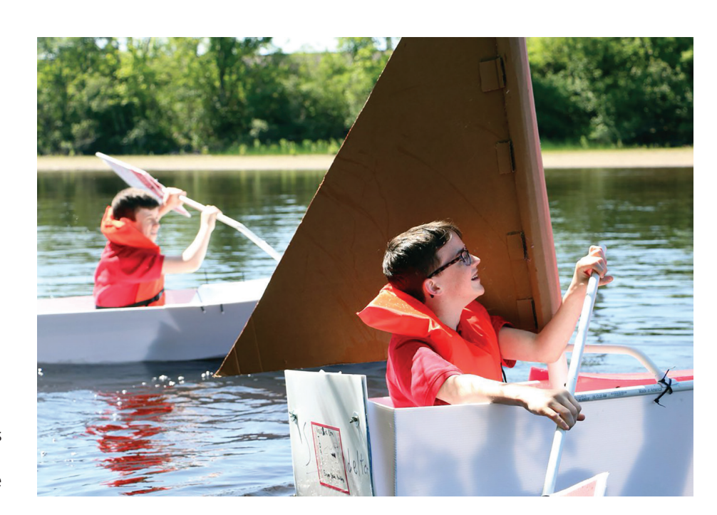
Middle School Students set sail (and paddle) on the Charles River in watercrafts of their own making. The event is a popular interdisciplinary Spring tradition.

When the CM president's job became available, an educational consultant reached out to him knowing he had studied the school.